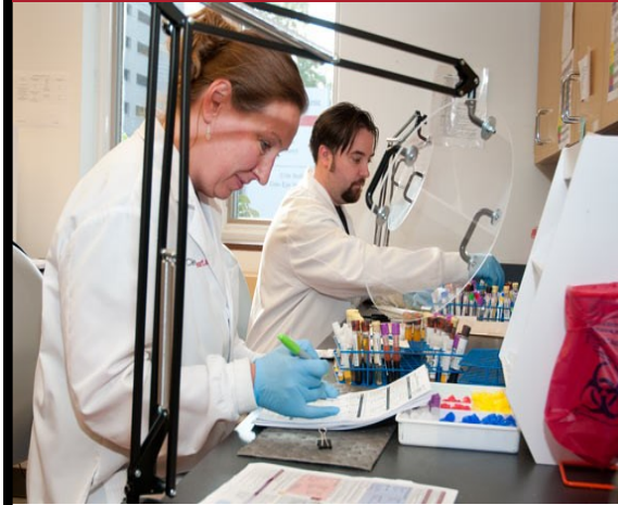
Cleveland Heart Lab