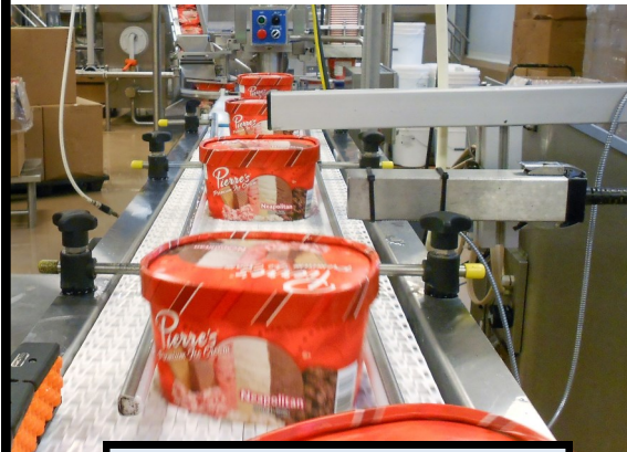
Pierre's Ice Cream